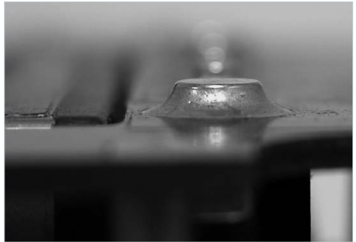
Figure 23.1 — Side profile of a Mini module solder joint

During the soldering process wetting can be identified by an even coating of solder on the barrel and pin. In addition to coating the surface of barrel and pin, the solder will gather at the intersection of the two and produce a trailing fillet along each surface. Once wetting has occurred, then upon solidification it will bond appropriately to both components, producing a quality connection. Figure 23.1 shows a side profile of a good solder joint with a Mini power module. Notice that for both examples the solder forms a concave meniscus between pin and barrel. This is an example of a properly formed fillet and is evidence of good wetting during the soldering process. The joint between solder and pin as well as solder and pad should always exhibit a feathered edge. In Figure 23.1 it can also be seen that the solder covers a good deal of the surface area of both the pin and the pad. This is also evidence of good wetting. Notice also that the solder joint has a smooth surface with a silver color. This is evidence of good immobilization of the joint during cooling as well as good cleaning of the board prior to soldering. All soldering connections should exhibit similar characteristics regardless of whether they are soldered by hand or wave soldered.