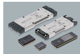
BCM bus converter modules

Inputs: 36 – 60V 38 – 55V 200 – 330V 200 – 400V 240 – 330V 260 – 410V 330 – 365V 360 – 400V 400 – 700V 500 – 800V Output: 2.4 – 55V Current: Up to 150A Peak efficiency: Up to 98% As small as 22.0 x 16.5 x 6.7mm