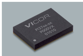
ZVS buck-boost regulators

Input: 8 – 60V Output: 10 – 54V Power: Up to 200W Peak efficiency: Over 98% As small as 10 x 14 x 2.5mm