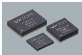
ZVS buck regulators

Inputs: 12V (8 – 18V), 24V (8 – 36V), 48V (30 – 60V) Output: 1 – 16V Current: Up to 22A Peak efficiency: Up to 98% As small as 7 x 8 x 0.85mm