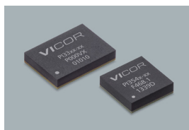
ZVS buck regulators

Inputs: 12V (8 – 18V), 24V (8 – 36V), 48V (30 – 60V) Output: 1 – 16V Current: Up to 22A Peak efficiency: Up to 98% As small as 10.5 x 10.5 x 3.05mm