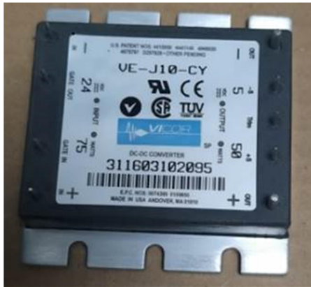
Figure 4 – Old label